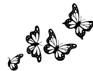
butterfly / butterflies