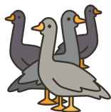
Gooses / Geese

Directions: Circle the correct form of the irregular plural nouns.